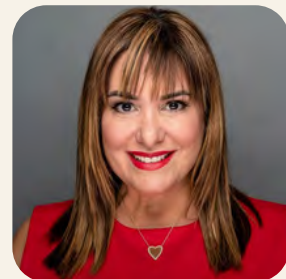
President & CEO We Are ALX